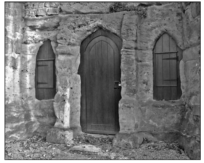
The cave from the outside with its new doors and shutters.

temporarily stabilised, and thereby also account for the very low weathering rate recorded in the following period. There was no recognisable impact from the very heavy rainfalls in June 2007.